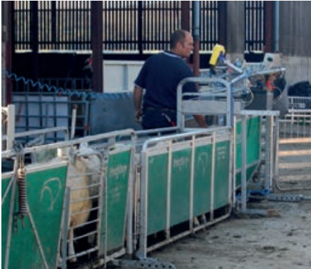
Static reader in motion

Static readers enable hands-free recording. They comprise of a reader and an antenna (the reader transmits and receives radio frequency signals via the antenna).