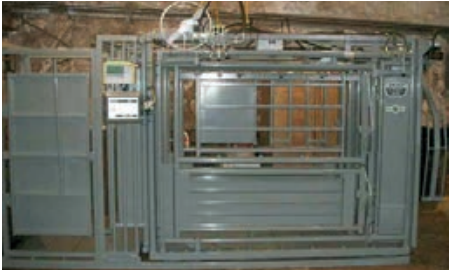
UHF reader on a cattle crush

Currently, due to the perceived limitations of LF and current ISO standards (limited data on chip, slow read rates, limited read range); there is some trial work taking place looking at UHF technology in cattle identification. Currently, LF readers would not work with UHF tags.