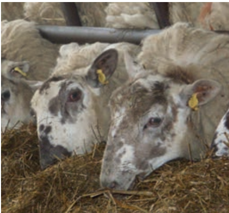
Sheep with EID tags