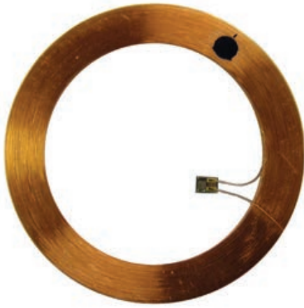
Coil from EID cattle tag