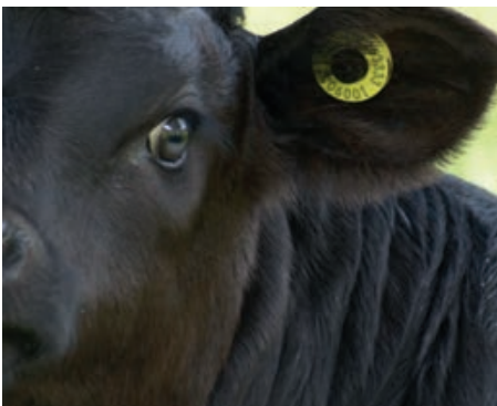
Cattle button tag