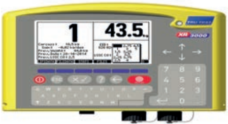
Weigh head to store data

EID linked scales can be used in one or both of two ways: